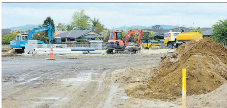
PYES PA PROGRESS: Residents won't have so far to travel for their shopping when this emerging commercial development opens for business in about six months.

However the 1.5ha development will be dwarfed by Tauranga Crossing at Tauriko where the first stage scheduled to open in early 2016 will include The Warehouse, Warehouse Stationery, Warehouse-owned Noel Leeming and a Pak 'n Save supermarket.